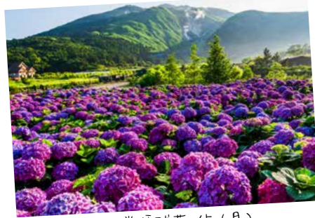
阳明山赏绣球花（5-6月） Yangmingshan Hydrangea Flower (May - June)