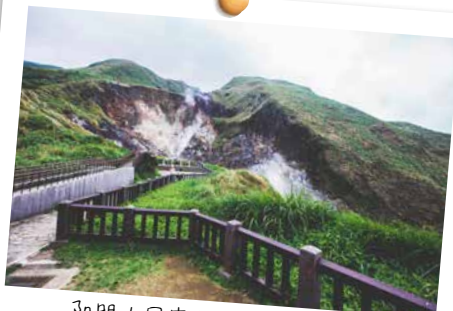
阳明山国家公园（小油坑） Yangmingshan National Park (Xiaoyoukeng)