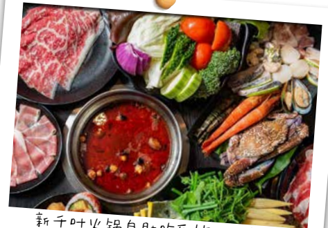
新千叶火锅自助吃到饱（C餐） Steamboat Buffet